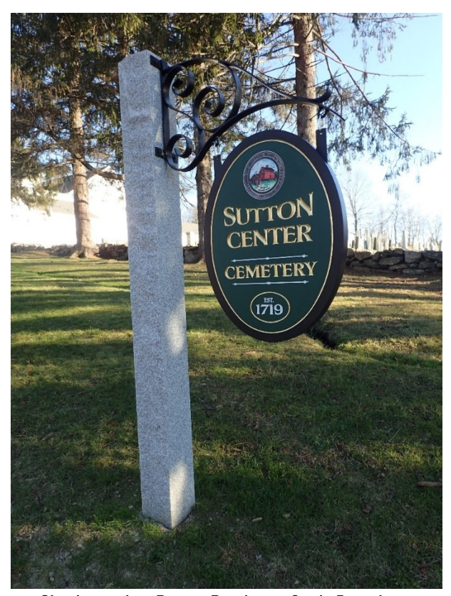
Sign located on Boston Road near Cattle Pound