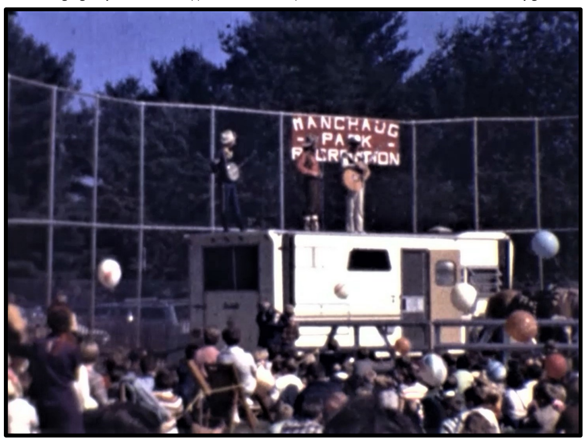
The Rex Trailer Show 1969

The Ball Field succeeded in making memories for generations. For all those living in the Village in the late 60s, the marquee event of the park had to be The Rex Trailer Show performing on an RV at the backstop and the community events which followed, including a greased pig contest. From summer recreation, to softball, little league, men's softball, soccer, basketball, ice skating on a flooded basketball court, tag, fights, you name it, it happened in that little spot of land that was the whole world to so many generations.